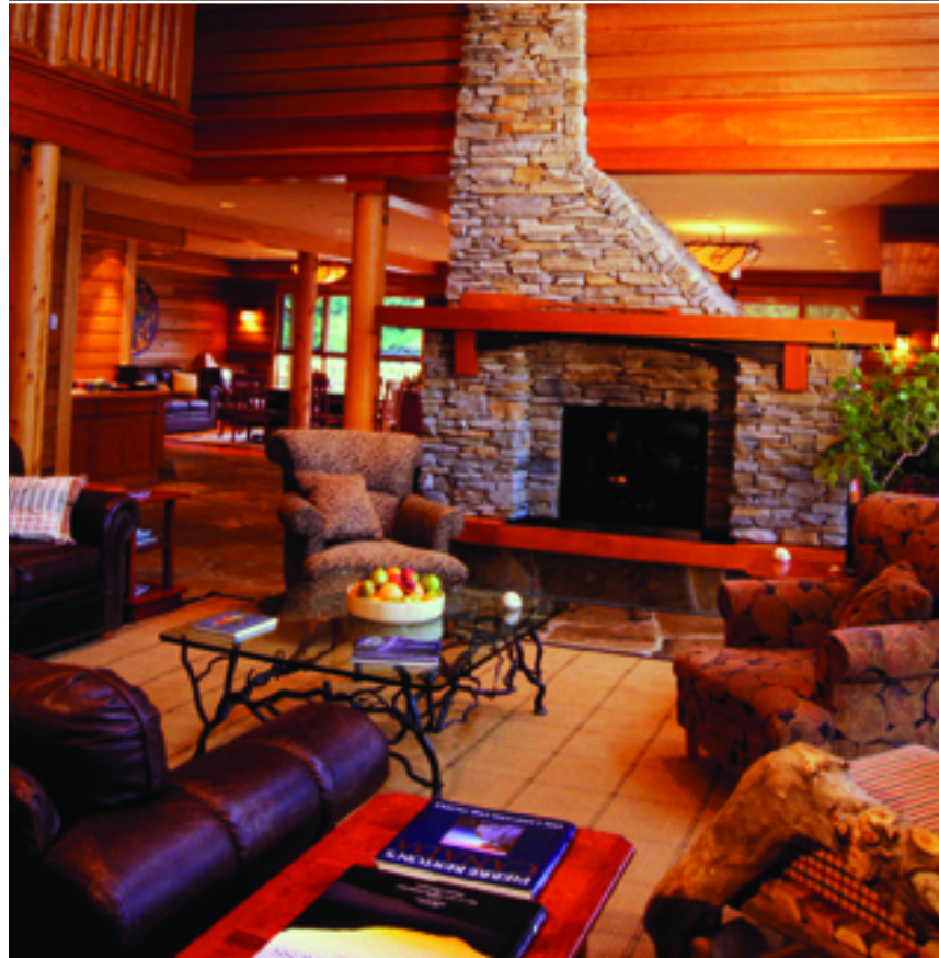
This page and previous page: King Pacific Lodge, built on a salvaged Navy barge, summers in Barnard Harbour on Princess Royal Island. The interior of the Great Hall, with its rock-clad fireplace, pays homage to local First Nation and Tsimshian art and natural elements. Right: Outdoor adventures offered at the lodge include fishing, kayaking and helicopter tours of the striking landscape of British Columbia.

A “floating lodge” built on a salvaged U.S. Navy barge, King Pacific Lodge is self-sufficient, bringing equipment, food and all supplies from outside. It’s non-polluting, too, shipping every scrap of waste, from the last uneaten lamb chop to processed sewage back outside. And like the whales, it migrates, wintering in Bella Bella and summering in Barnard Harbour, some 75 miles away.