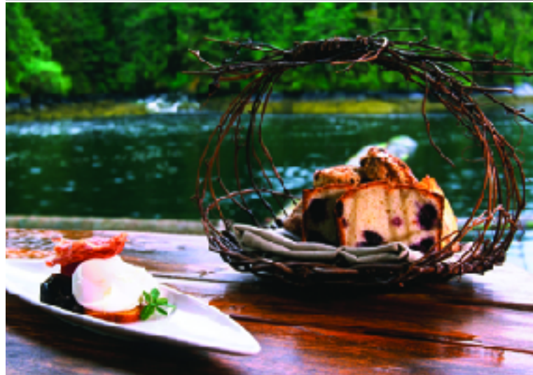
This page: King Pacific Lodge leaves the notions of dad's fishing lodge behind, incorporating luxurious necessities, from massage treatments and gourmet cuisine to first-class service, into the daily routine.

Open May to October; closed in winter. All-inclusive rates for a seven-night stay start at US$7,650. Three- and four-night stays are also available. Included are roundtrip flights between Vancouver and King Pacific Lodge (via Bella Bella), meals and snacks, beverages, fishing and sports equipment, water sports, ocean fishing, wildlife cruises and hiking, and salmon packing for transport. (Spa treatments, helicopter and float plane outings and Kermode Bear trips not included.) For more information or to make a reservation, please call King Pacific Lodge at 888.592.5464, or visit www.kingpacificlodge.com .