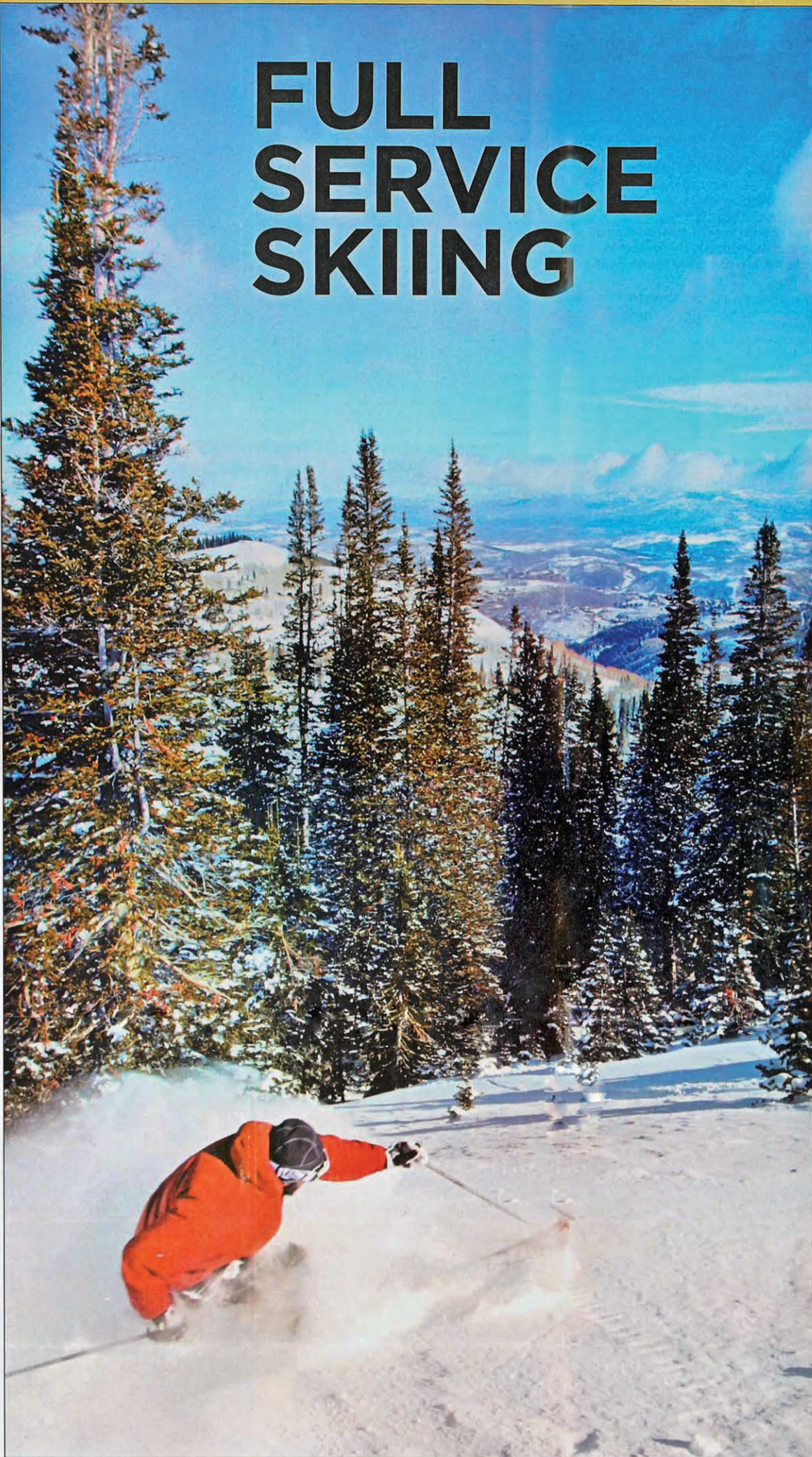
Even the snow pampers skiers at Deer Valley Resort in northern Utah.