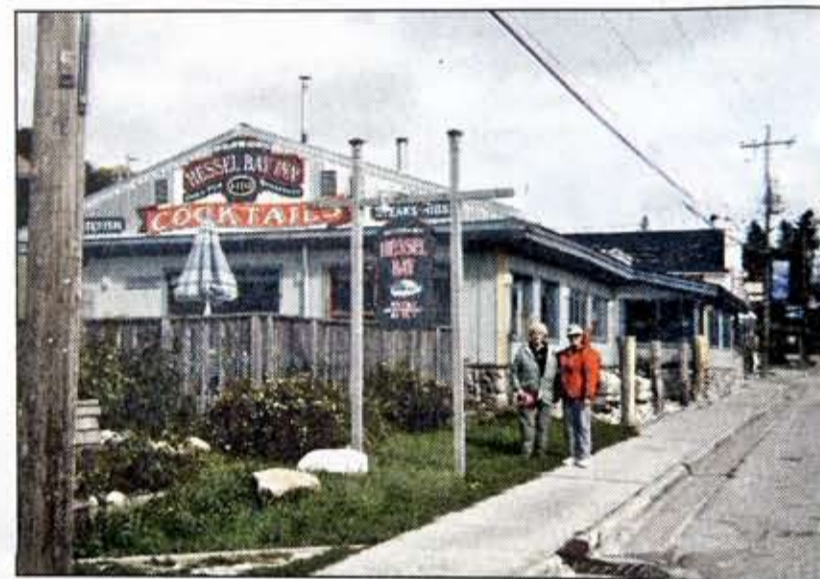
Village center in Hessel.

As for our reunion, it was a shot in the arm. It was so wonderful, we're doing it again this year in Colorado. We've gone our separate ways, but it hasn't mattered. Growing up in the same town with the same neighbors and in the same schools forged a lifelong bond. As did our long-ago summers in Hessel's north woods.