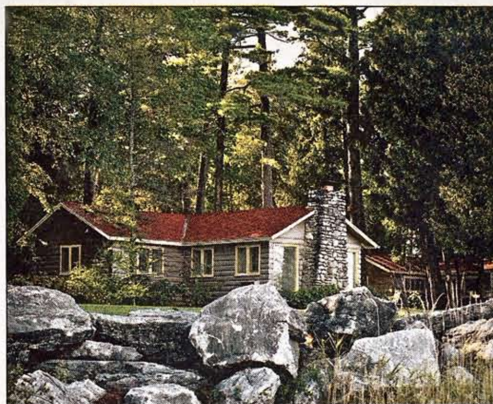
Lakeside cottage at Gordon Lodge on Green Bay Peninsula.

Many were the hot summer days we spent at the beach, pretending to ignore our male classmates. Even bet-