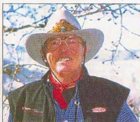
Steamboat's "champagne powder" is one reason why former Olympian Billy Kidd hitched his star to Steamboat Ski Resort.

This is intermediate country. More than half the mountain ranges from groomed cruisers to almost-expert trails. One-tenth of the trails