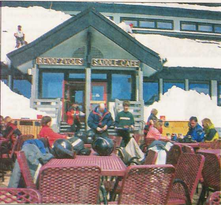
Skiers at Steamboat Springs Resort can savor meals at places such as the Rendezvous Saddle Cafe.