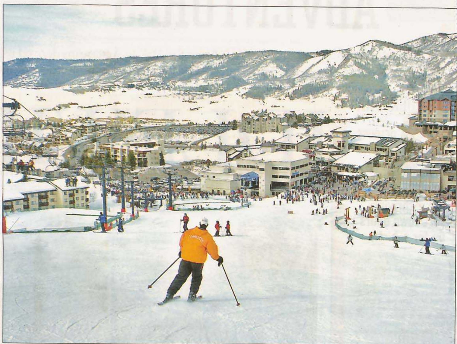
Steamboat Ski Resort's base area — in need of a face-lift — is always crowded, but has plenty of personality.