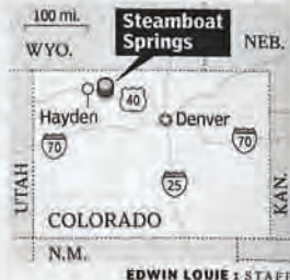
EDWIN LOUIE: STAFF

For a rollicking good time and great food, book a