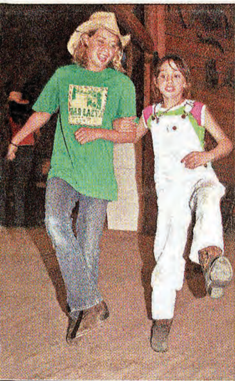
Kids kick up their heels at Wednesday night line dancing at the Bar Lazy J.

Teams compete at 'cow pushing' at the ranch. Guests are assigned one horse for use throughout the week.