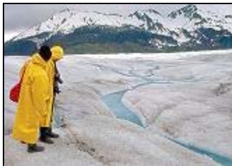
Travelers cruising Alaska's waterways can take advantage of excursions from port cities, like this helicopter tour to Mendenhall Glacier out of Juneau.