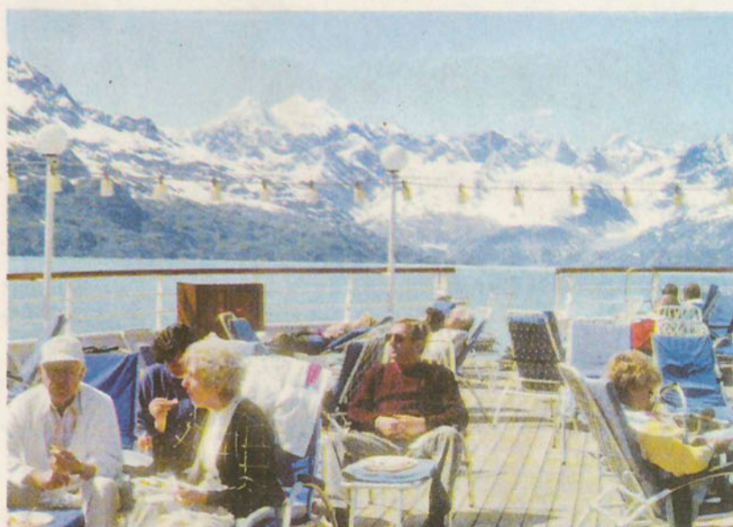
Cruising Alaska's waterways on small ships, like the 48-passenger Contessa with its open sun roof, allows tourists to get up close and personal with the real Alaska.

ports such as Ketchikan, Juneau and Sitka, and every year these behemoths swell in size. The current generation of mega-monsters carry up to 3,000 passengers; several 4,000- to 6,000-passenger ships are under construction. These floating resorts don't focus on the destination; they celebrate entertainment, from casinos, restaurants and floor shows to Internet cafes, aerobics