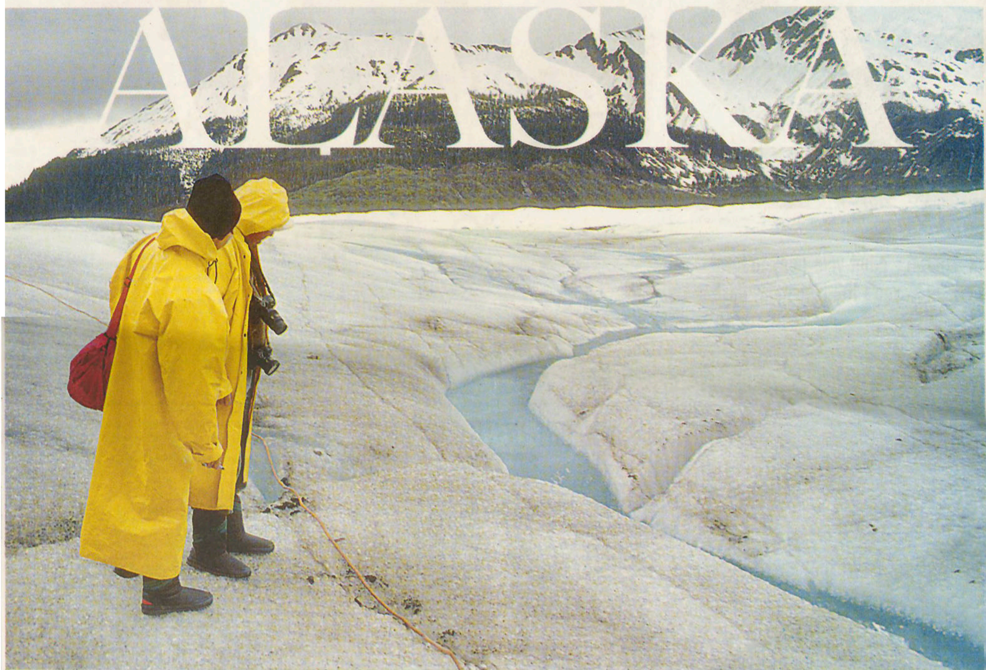
Travelers cruising Alaska's waterways can take advantage of excursions from port cities, like this helicopter tour to Mendenhall Glacier out of Juneau.