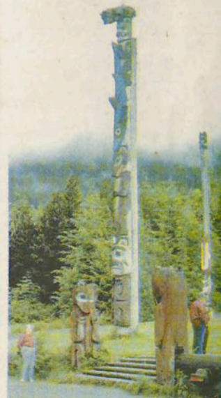
Left: Restored Victorians buildings in Skagway's National Historic District. Right: A totem pole collection in Ketchikan attracts cruise passengers.