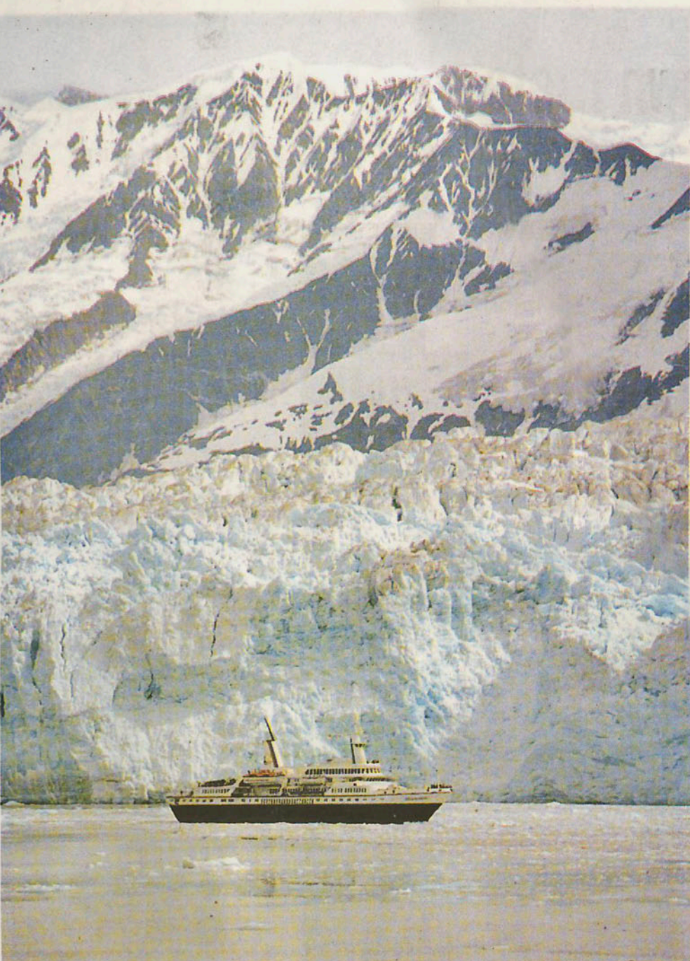
A ship cruises alongside Hubbard Glacier in Yakutat Bay at Wrangell-Saint Elias National Park.