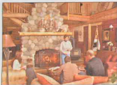
Relaxing in the Great Room, Siwash Lake Ranch.

In summer, Rogers hires a chef, but in winter she wears the toque, serving three meals daily. The cuisine, best described as healthy American, mixes salmon, steaks and chicken with rice, vegetable dishes and salads. A tray with coffee and muffins appears at your room early each morning and appetisers and wine are served before dinner. Rogers'