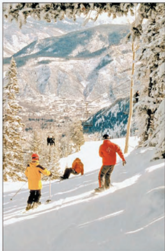
Buttermilk Ski Area in Aspen, Colo., with its gently rolling terrain, is a terrific place for intermediate skiers.