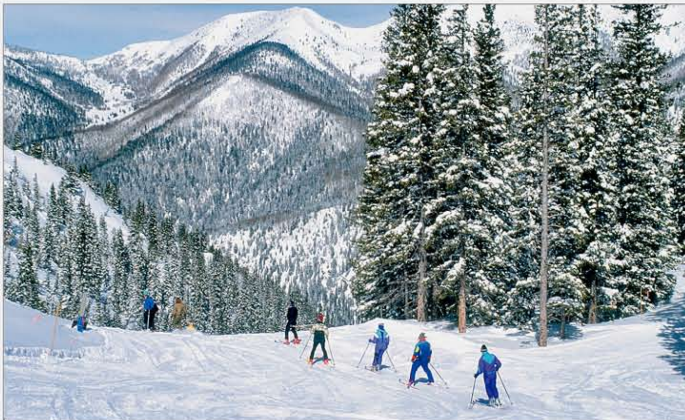
Winter Park, on the Front Range of the Rocky Mountains in Colorado, has challenging runs; but it emphasizes its ski schools.

Ski central is still at the Lodge at Big Springs, at the