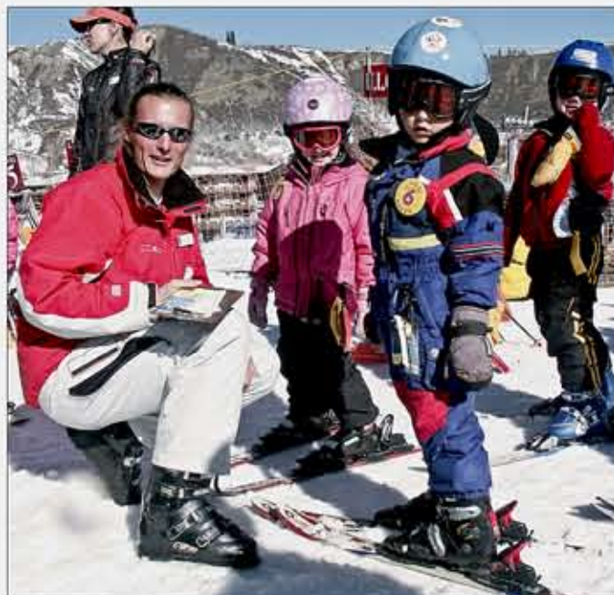
The young children's program at the Buttermilk Ski Area is the best in the area around Aspen, Colo.

Winter Park, in the Front Range of the Rocky Mountains west of Denver, has