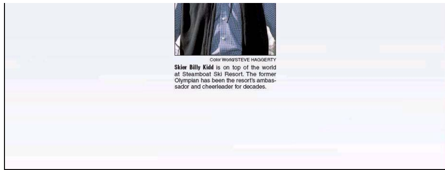
Skier Billy Kidd is on top of the world at Steamboat Ski Resort. The former Olympian has been the resort's ambassador and cheerleader for decades.

Good snow and safe slopes make Steamboat Ski Resort excellent for family skiing.