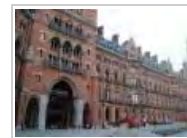
PHOTOS: London's St. Pancras Hotel