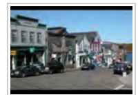
What to Do in Bar Harbor This Summer